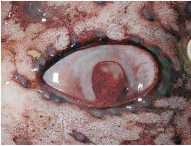
Fig. 1. Right eye surrounded by 17 photophores.